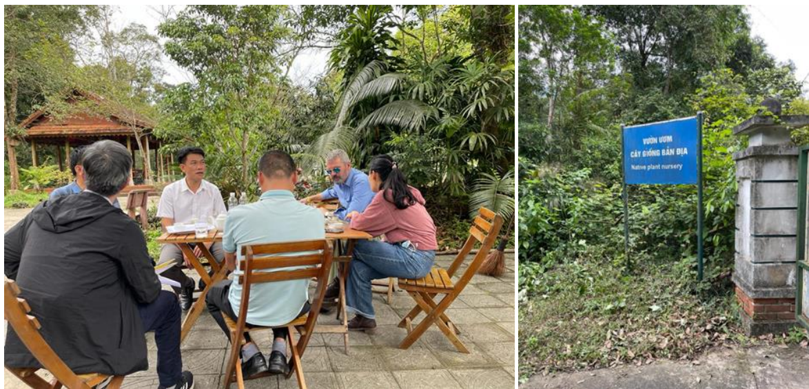
Figure 3. Meeting with PNKB National Park representatives; native plant nursery panel.

The project team also visited the Center for Rescue, Conservation and Creature Development in Phong Nha Ke Bang (PNKB) National Park (close to the project site) to discuss with PNKB representatives native tree seed supply and experiences in establishing and maintaining nurseries for endangered, endemic species. The team is also in discussion with other organisations in and nearby Tuyen Hoa district to explore collaborative market development options for agroforestry products ( Figure 3 ).