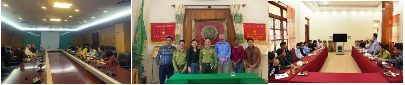
Figure 2. Meetings with policy makers. From the left- to right- hand side: Ministry of Environment and Natural Resources, Quang Binh Provincial Sub-Department of Forest Protection, People’s Committee of Tuyen Hoa District and Communes in the project site.

The project team also visited the Center for Rescue, Conservation and Creature Development in Phong Nha Ke Bang (PNKB) National Park (close to the project site) to discuss with PNKB representatives native tree seed supply and experiences in establishing and maintaining nurseries for endangered, endemic species. The team is also in discussion with other organisations in and nearby Tuyen Hoa district to explore collaborative market development options for agroforestry products ( Figure 3 ).