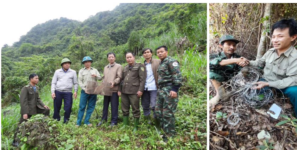
Figure 10. Releasing native wildlife back into the nature during the patrol activities of the VCG.

In year 1, the project achieved significant milestones towards reducing forest biodiversity degradation and threats to the Hatinh langur. The project empowered the Voluntary Conservation Group (VCG) through a range of activities, including equipping them with patrolling and protecting devices,. As a result, the VCG's efforts and impact strengthened, raising their visibility and recognition among the local community ( Figure 10 ). The project also provided initial training to community members on propagation techniques and business-orientated nursery operations. In the first year, the project also planted 17,000 seedlings of native tree species, achieving 24% of the targeted number as per Outcome Indicator 0.2. Additionally, baseline and agroforestry surveys identified potential agricultural products and models for trialling in the agroforestry pilots to improve the livelihoods of households impacted by restrictions following the SUF establishment. Overall, the project has made good progress towards achieving the Outcome by 2025.