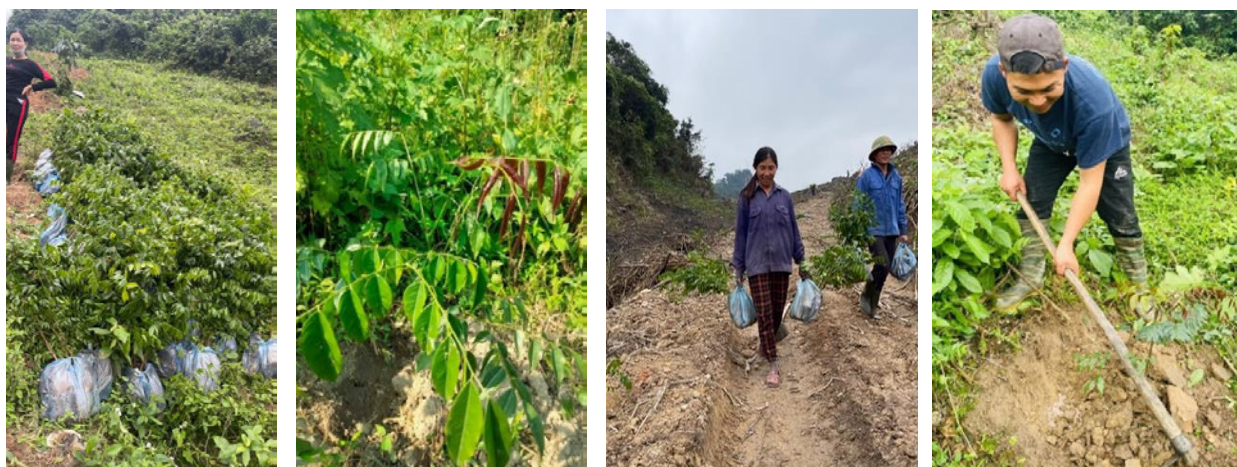
Figure 8. Planting native forest tree seedlings in Son Hoa and Dong Hoa communes.

Output 3. Knowledge of and capacities and capabilities of local communities in Tuyen Hoa district in forest restoration, sustainable and income generating agroforestry, small-scale farm businesses, and prevention of zoonotic diseases from close animal-human interaction, are increased