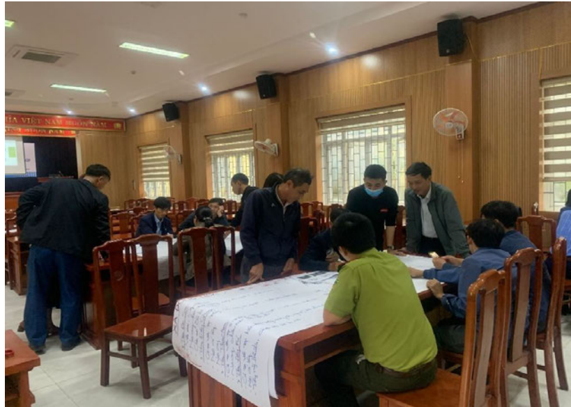
Figure 5. Focus group discussion on sustainable agroforestry models.

The project also conducted in-person interviews with 46 households in the four communes Dong Hoa, Son Hoa, Thach Hoa, and Thuan Hoa identify current agroforestry models and assess their economic benefits and climate resilience. The findings indicate that local people are aware of the benefits of agroforestry as a more sustainable farming practice due to its ability to generate diverse products and sources of income. In the four communes, pomelo and orange are currently the main commercial agroforestry fruit trees. Crops including spring onion, taro, pumpkin, turmeric as well as free-range chicken also provide significant incomes. Households also plant native tree species such as the threatened Aquilaria crassna and Dalbergia tonkinensis , as well as Prunus arborea , Michelia tonkinensis and Chukrasia tabularis in their home gardens. Planting native tree species in agroforestry not only provides for windbreak and timber but also contributes to soil enrichment, restores ecosystem functions, and supports ex situ conservation. Despite these benefits, agroforestry development in the four communes faces several challenges, including limited land size, lack of technical knowledge of appropriate agroforestry design and suitable plot management options, and limited market access ( Annex 4.14 ).