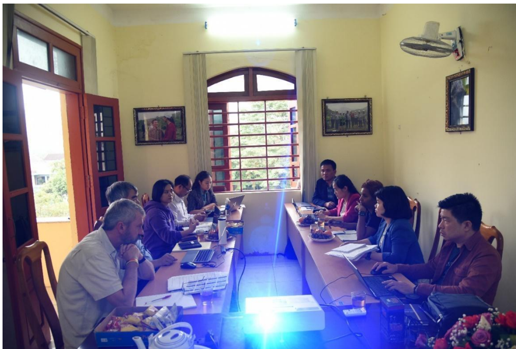
Figure 4. Second PMT meeting, 16 March 2023 in Quang Binh.

Besides that, in June 2022, a further, local level committee consisting of six members from the Department of Agriculture and Rural Development, the Forest Protection Department, and representatives of four communes was formed for further project monitoring support ( Annex 4.11 ).