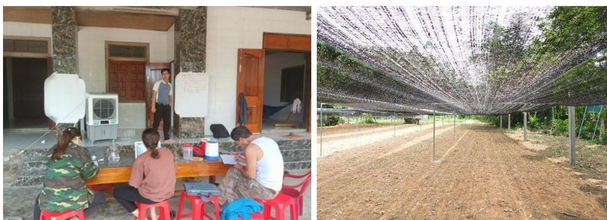
Figure 9. Training on nursery development in Dong Hoa commune.

Terms of reference for the community-based nurseries were established, and a consultant was hired to assist the community to build and further develop the nurseries throughout the project ( Figure 9; Annex 4.19 ). The first nursery located in Dong Hoa commune has been completed and will be fully operational by May 2023. The second nursery site has been selected in Dai Son Village, Dong Hoa.