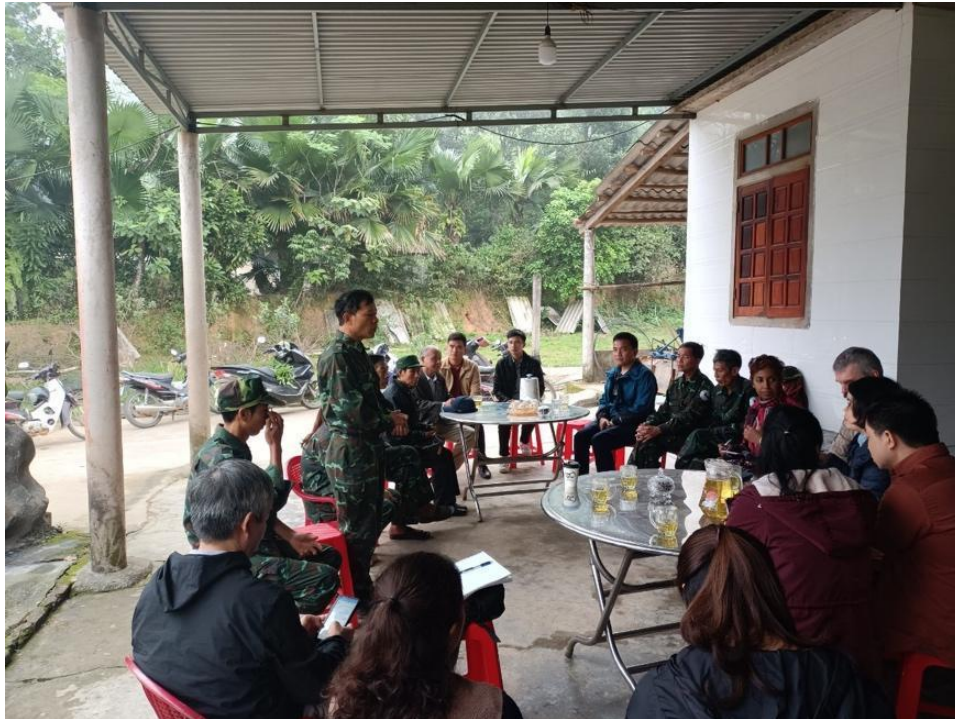
Figure 7. Project team meeting with the Voluntary Conservation Group.

Also, in March 2023, a consultation meeting was held to discuss the establishment of a cooperative ( Annex 4.15 ) aimed at generating new income alternatives. The cooperative's objectives would be to develop and operate nurseries, support eco-tourism development, and process and sell medicinal plant products. The cooperative is expected to formally establish in April 2023.