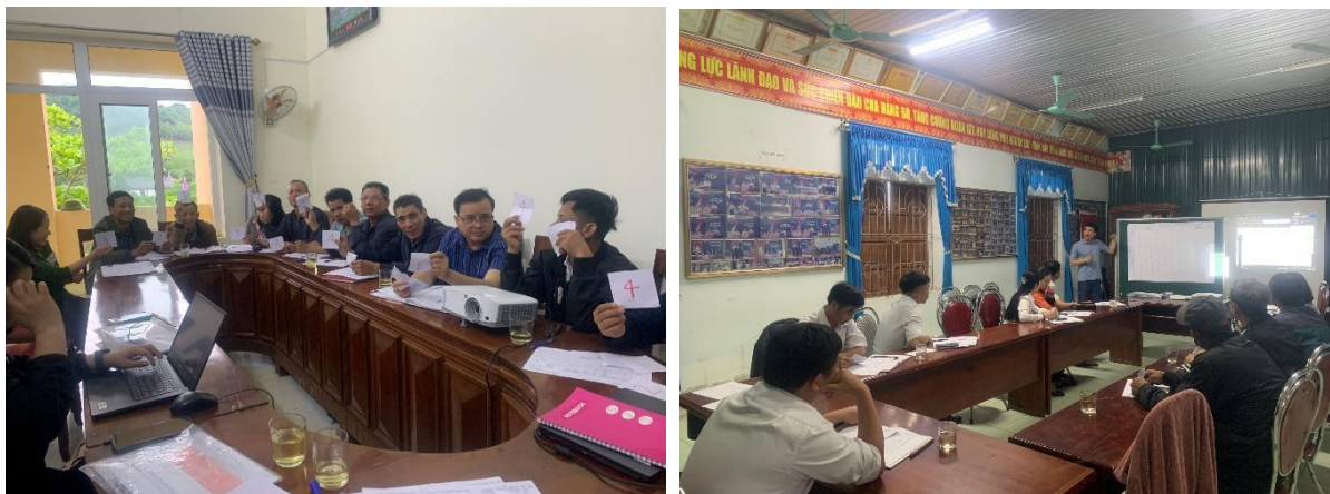
Figure 6. Focus group discussions with communities of the four communes to rate products for market development.

free-range chicken. Weak market linkages and lack of processing facilities, as well as no quality certification are the main challenges for successful market development.